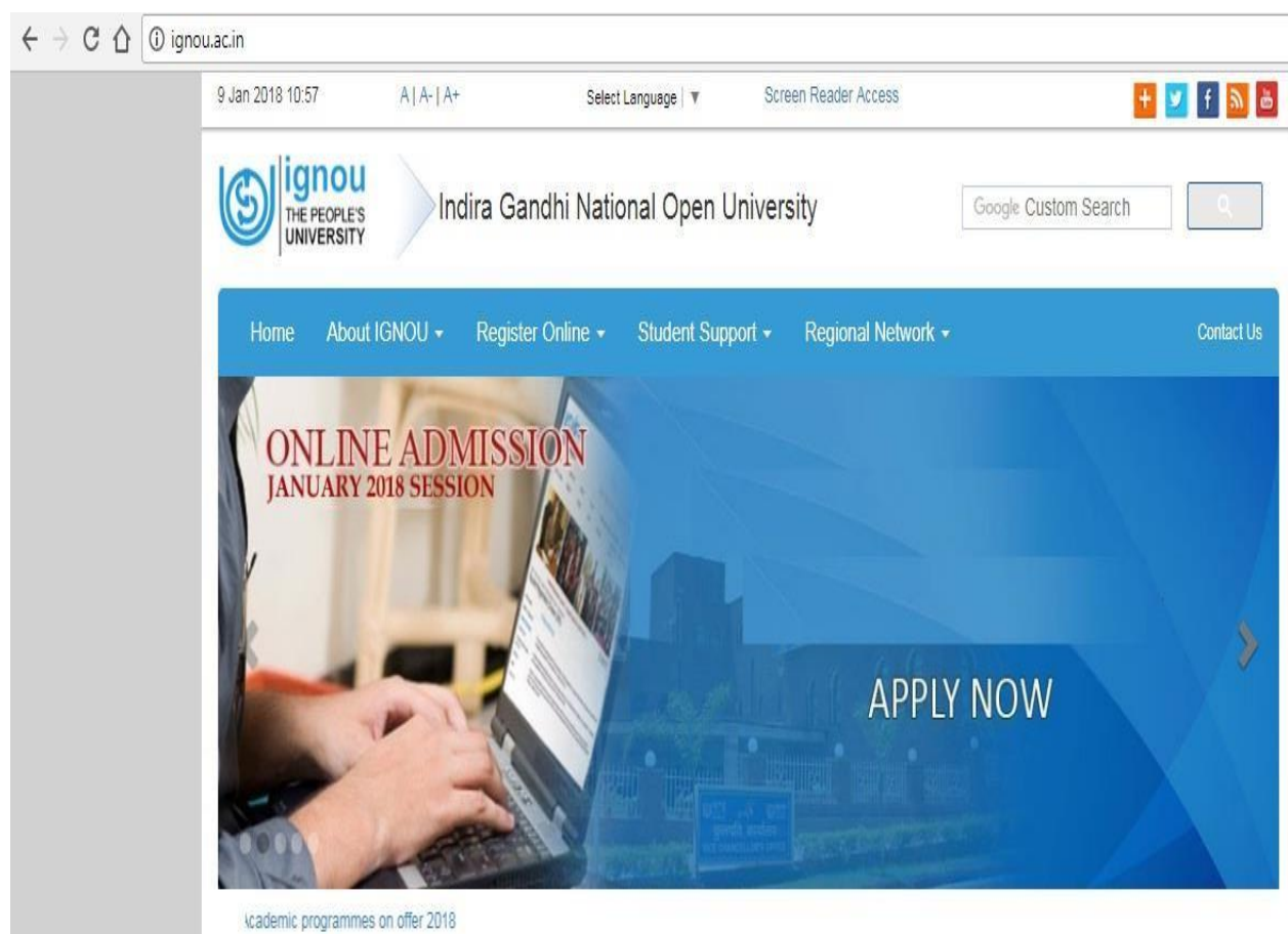
Fig. 1 : Web page of IGNOU Website

You can get the details of information about IGNOU from the website( www.ignou.ac.in ). If you face any problem or have any doubt, you should e-mail to the programme coordinator.