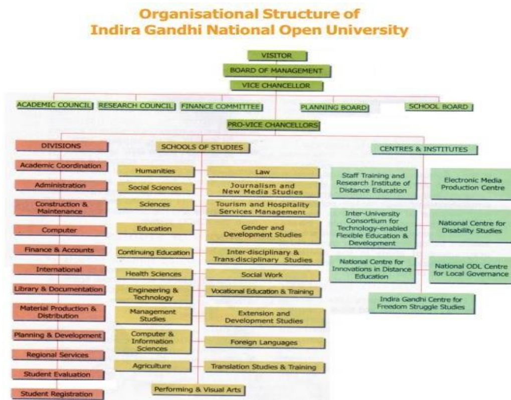
Fig. 1: Broad Organisational Structure of IGNOU