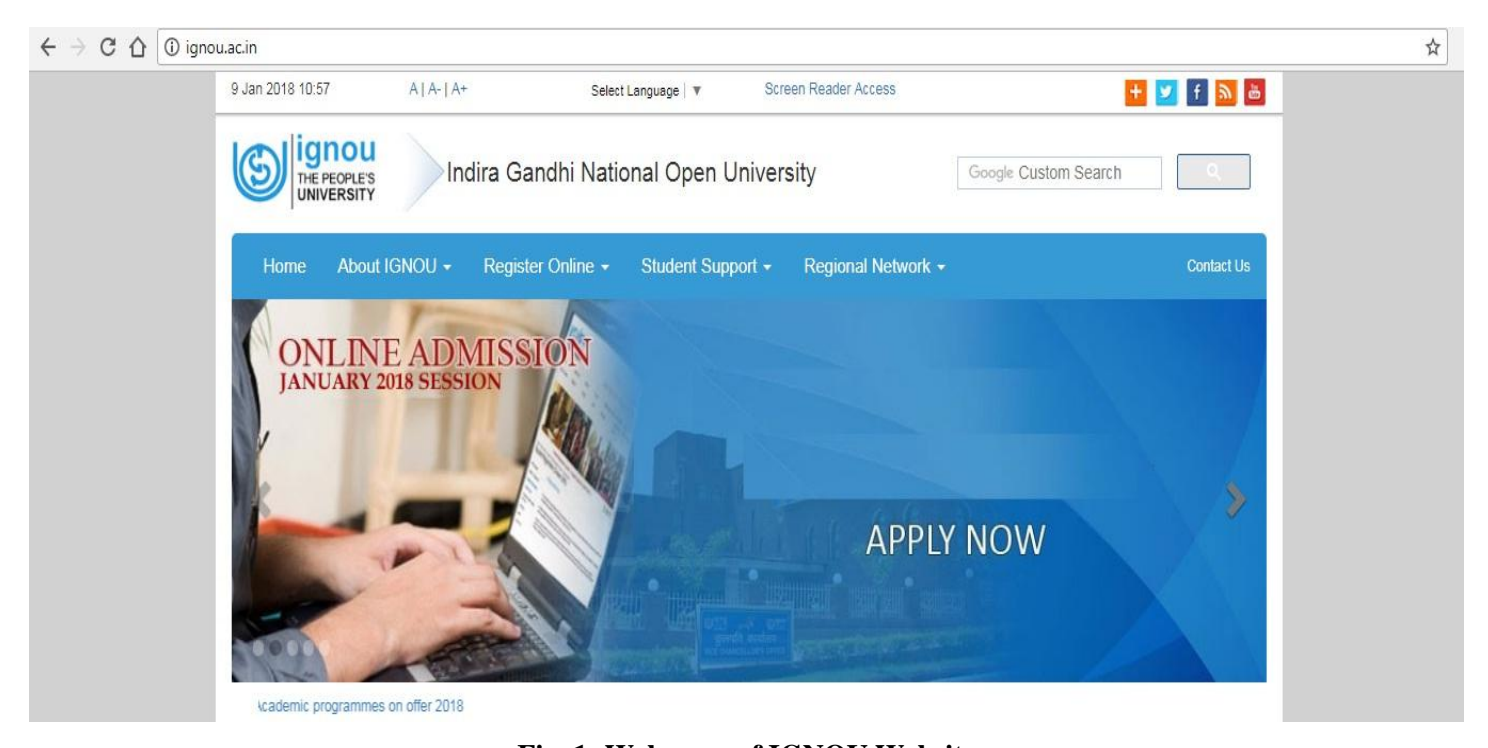
Fig. 1: Web page of IGNOU Website

You can fill up the theory term-end form online by clicking on the rolling message in the home page on-line Examination Form for T.E.E. . After you fill up the required information, you have to click it to submit. Then you have to wait for sometime till a receipt number gets displayed. Please take a print out of the receipt number which will be useful if you do not receive your admit card in time.