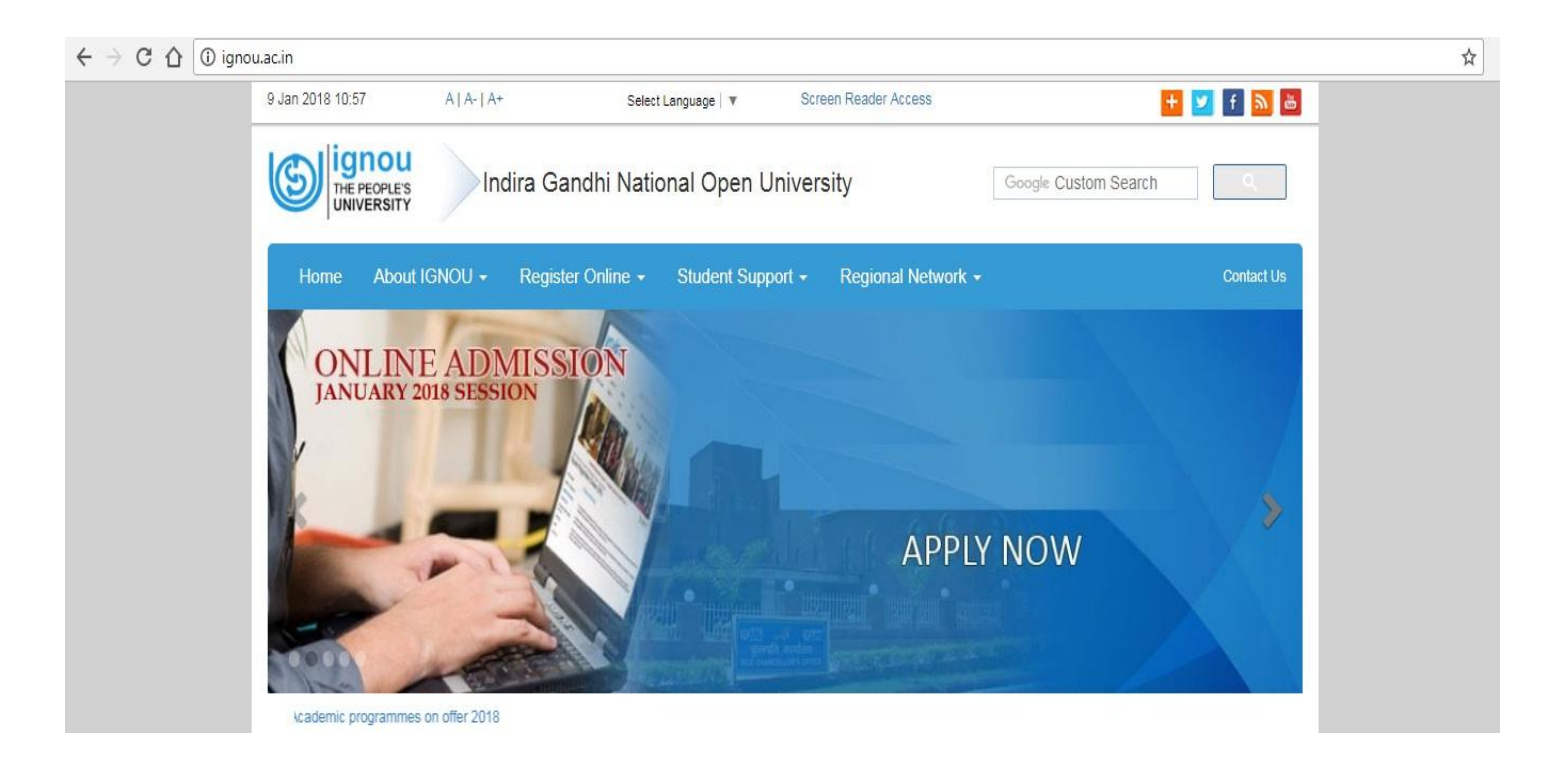
Fig. 1: Web page of IGNOU Website

You can get the details of information about IGNOU from the website. If you face any problem or have any doubt, you should e-mail to the programme coordinator.